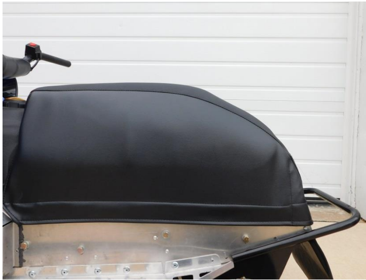
When the seat is installed correctly it should look like this.