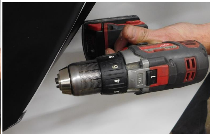
WRONG ANGLE TO HOLD DRILL