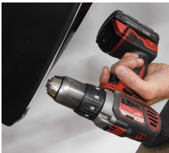
PROPER ANGLE TO HOLD DRILL TO ENSURE SUPPLIED PLUG CAPS FIT